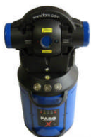
FARO Laser Tracker.

The current accepted method for performing a shaft taper inspection utilizes a bluing fit. This bluing fit in conjunction with a standoff measurement is the process Navy shipyards use to ensure interchangeability of all shafts and couplings. This process has been used for over fifty years and although proven effective, it is susceptible to operator interpretation as well as the need for highly skilled fitters. Another area for concern is that there are only 5 known gages throughout the U.S. shipyard community. Each of these gages has their own imperfections. It has been stated that this process requires the shaft taper to be hand worked to fit the gage's imperfections.