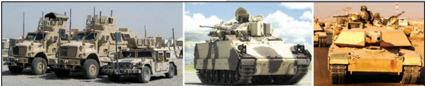
Mine Resistant Ambush Protected Vehicle (MRAP), HMMWV, Bradley Fighting Vehicle, and M1 Abrams Main Battle Tank