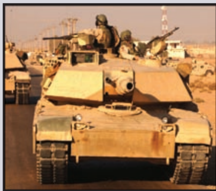
Ground Combat Vehicle (GCV) – M1 Abrams Main Battle Tank

Significant advances have been made toward achieving program goals for a reduced cost, high reliability VAM. FY06-07 efforts established VAM torque requirements, developed improved blade manufacturing techniques, and demonstrated the baseline number of piezoelectric motors could be reduced by half. Progress continued in FY08 with a focus on VAM manufacturing including development of on-shore motor sources, automated warm test stations, and a Design For Manufacturing and Assembly (DFMA) event to identify cost-reduction opportunities for the 3rd Gen Dewar. In 2009, a 3rd Gen IR IDCA ManTech Industry Day was held to brief program progress to industry to facilitate technology trans-