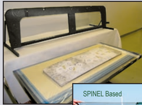
Segmented 16" x 29" SPINEL Window