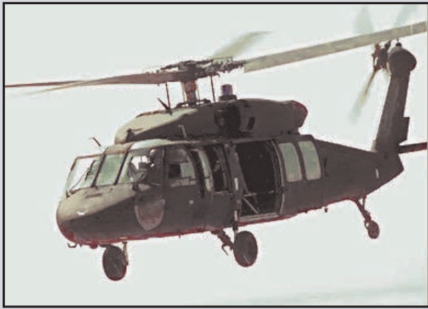
UH-60 Black Hawk Helicopter