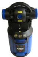
FARO Laser Tracker.