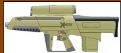
XM25 Integrated Airburst Weapon System